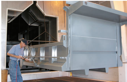
Partial cure and caulk