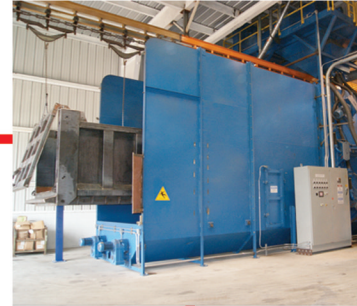
Automated shot blast